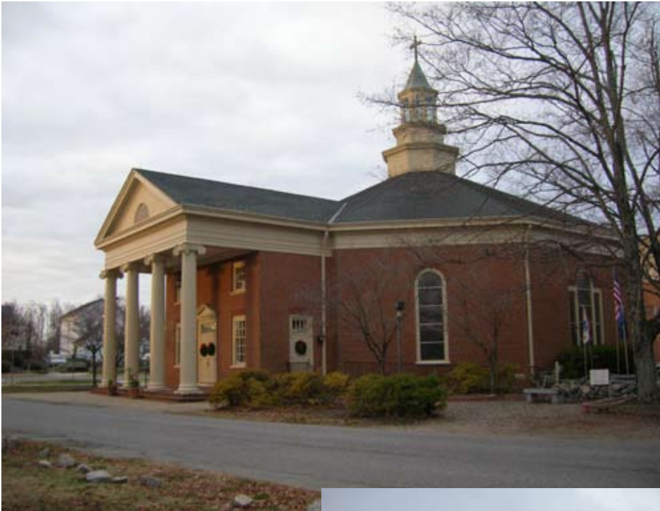
Mount Pisgah United Methodist Church