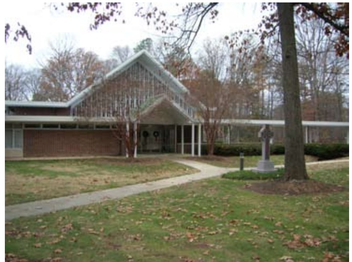
Bon Air Presbyterian Church