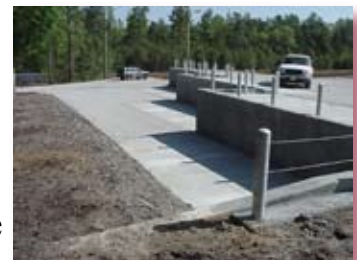
Convenience Center New Kent County, VA