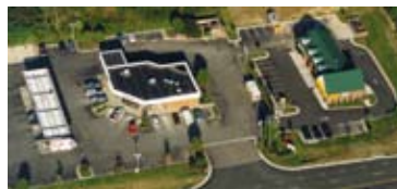
Atlee Station Hanover County, VA