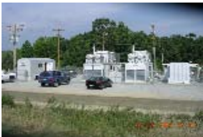
Landfill Gas to Energy