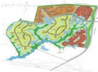
Farms of New Kent New Kent County, VA

Resource International, LTD. offers a full range of engineering and technical services to support commercial, residential, and industrial property developers. These services include site plan preparation, public hearings and presentations, development layout and feasibility studies, site and project engineering, commercial building design, recreational facility planning, on-site and off-site utilities, parking lot design, and project management.