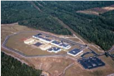
Regional Jail Facility

Resource International, LTD. has over 30 years of experience in assisting with permitting industrial projects. Project services include permits and compliance applications for: