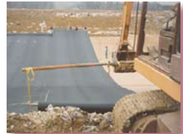
Membrane Liner Installation King William County, VA