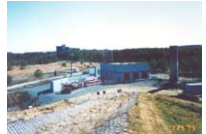
Landfill Gas to Energy