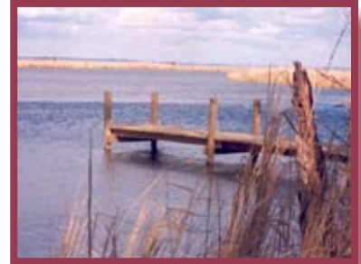
Dock Permitting (RP19)