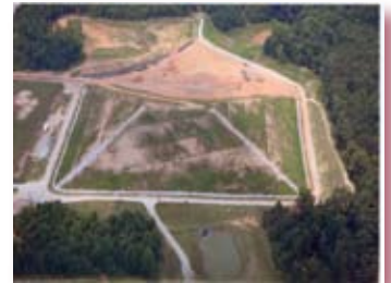
Landfill Closure Prince Edward County, VA