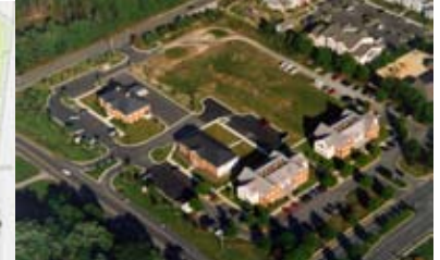
King Charter Hanover County, VA