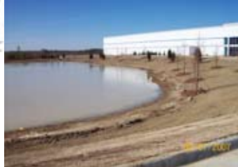
JDA Building Isle of Wight, VA