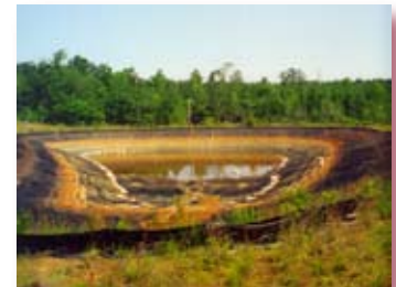
Leachate Pond Prince Edward County, VA