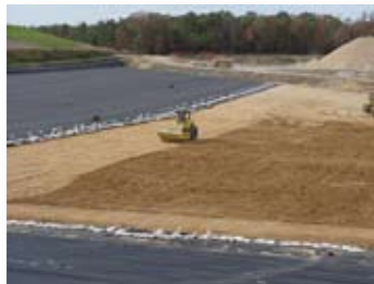
Liner Installation Ashcake Road Landfill