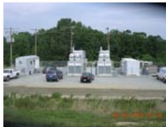
Landfill Gas to Energy Stafford County, VA