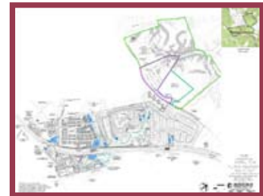
Road Layout Plan