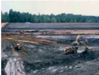
Lining Subgrade King & Queen Landfill

Resource International, LTD. has over 30 years of solid waste experience and a team on professional engineers, scientists, and technical professionals to meet your needs.