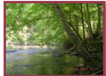
Waters of the US Delineation