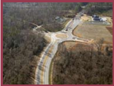
Route 106 - Roundabout

Resource International, LTD. incorporates transportation studies and design services in many of our projects. The transportation staff interacts with all Resource departments frequently to assist with questions of access, geometric standards, entrance permits, traffic operations, traffic generation, street design, and pavement design.