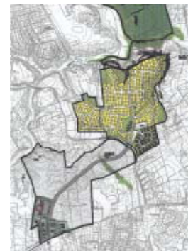
The Bluffs at Bell Creek, Hanover County, VA