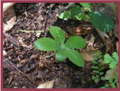
Small Whorled Pogonia ( Endangered Species)

Resource International, LTD. has a staff of natural resource professionals which includes biologists, ecologists, geologists, hydrologists, hydrogeologists, and engineers who are fully knowledgeable of all phases of environmental science.