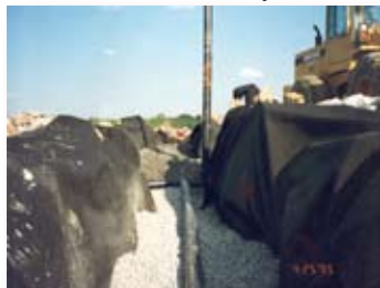
Active Gas Extraction System Fredericksburg, VA