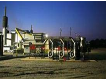
Brunswick County Landfill Republic Services, Inc./INGENCO 12 MW Peak LFG & #2 Fuel Oil