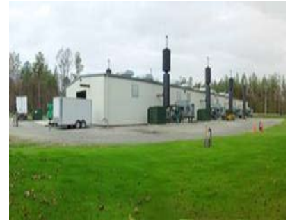
Charles City Landfill Waste Management of VA/INGENCO 16 MW Peak LFG & #2 Fuel Oil