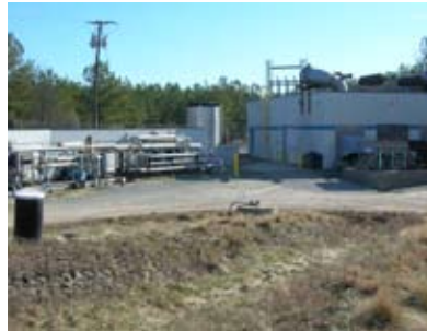
Private Closed Landfill Charles City Road, VA 6 MW LFG