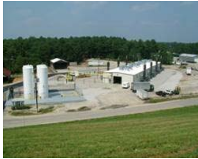
Shoosmith Landfill Shoosmith Construction/INGENCO 16 MW Peak LFG & #2 Fuel Oil