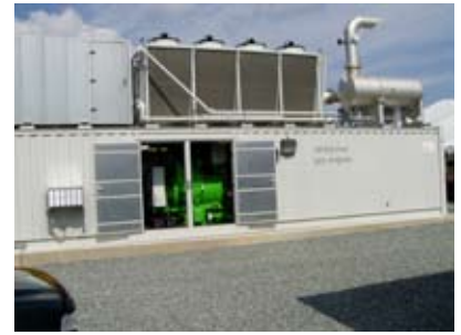
R-Board Ameresco Stafford, LLC 2.1 MW LFG