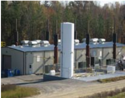
King and Queen Landfill Republic Services, Inc./INGENCO 12 MW Peak LFG & #2 Fuel Oil

Resource International, LTD. provides engineering, permitting, and contract support for landfill gas to energy plants. Each facility utilizes gas from active landfill gas extraction systems to generate electricity.